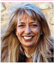
Baroness Susan Greenfield

All this she balances whilst adhering to her traditional beliefs and married to an entrepreneur with 2 boys.