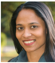
Rushanara Ali MP for Bethnal Green and Bow Labour Party

Rushanara Ali is a British Labour Party politician and Associate Director of the Young Foundation, who has been the Member of Parliament (MP) for Bethnal Green and Bow since 2010. As of October 2010, she has been appointed as part of the shadow team for the Department for International Development along with Mark Lazarowicz with Harriet Harman in charge