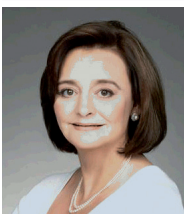
Cherie Blair QC Barrister specialising in public law, human rights, employment and European Community law

Born in Bury in 1954, Cherie grew up and went to school in Liverpool. The first member of her family to attend university, Cherie studied law at the London School of Economics and graduated with a First Class Degree in 1976. While studying for her Bar exams she also taught Law at the University of Westminster. Cherie came top of her year in her Bar examinations and was called to the Bar in 1976. She became a Queens Counsel in 1995 and sits as a Recorder, as part-time judges are known, and is also an accredited mediator.